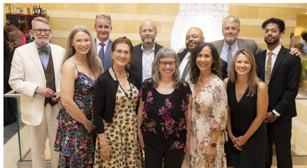
Hope House Foundation Board Members