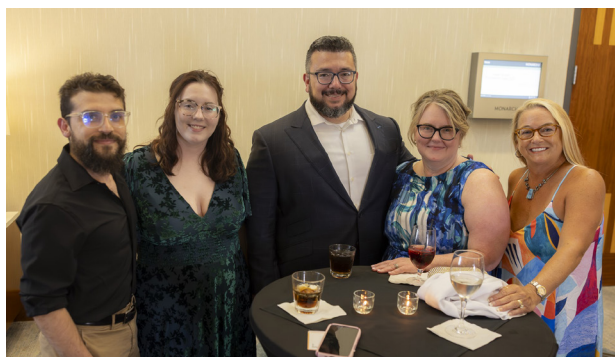
Presenting sponsors Brown & Brown Insurance